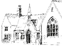
Blofield Primary School