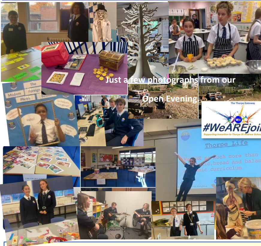
Just a few photographs from our Open Evening

Laundry Lane Thorpe St Andrew Norwich NR7 0XS Telephone: 01603 497767 Email: sfadmissions-tsa@yare-edu.org.uk