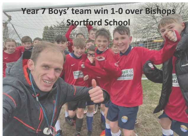
Year 7 Boys' team win 1-0 over Bishops Stortford School