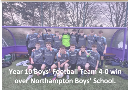
Year 10 Boys' Football Team 4-0 win over Northampton Boys' School.