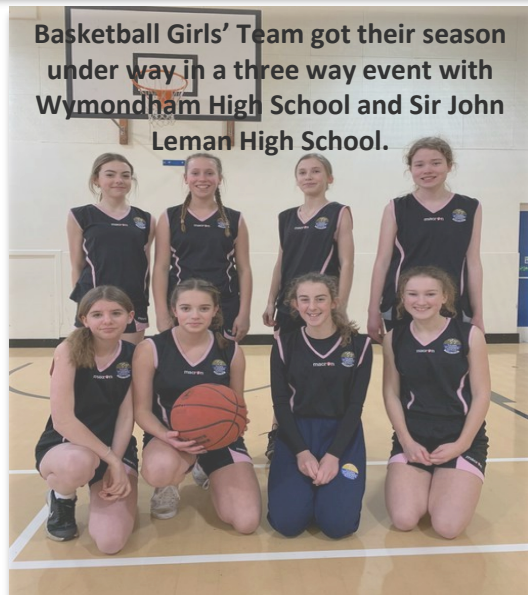
Basketball Girls' Team got their season under way in a three way event with Wymondham High School and Sir John Leman High School.