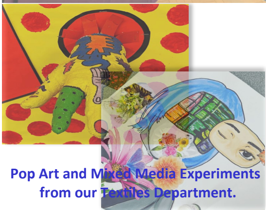
Pop Art and Mixed Media Experiments from our Textiles Department.