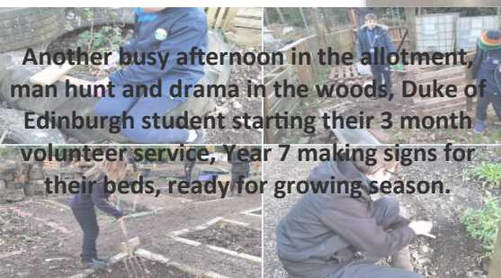
Another busy afternoon in the allotment, man hunt and drama in the woods, Duke of Edinburgh student starting their 3 month volunteer service, Year 7 making signs for their beds, ready for growing season.