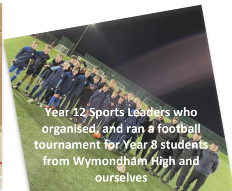
Year 12 Sports Leaders who organised, and ran a football tournament for Year 8 students from Wymondham High and ourselves