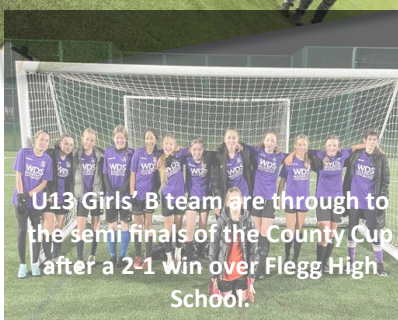
U13 Girls' B team are through to the semi finals of the County Cup after a 2-1 Win over Flegg High School.

Apprenticeship Evening – Thursday 9 February 2023 6pm to 8pm Calling Parents and Carers Do you want to learn more about apprenticeships and how they work? Come along to the Parents' Evening on Thursday 9 February 2023 and you will have the chance to find out what an apprenticeship is, the different levels of qualifications and the benefits to your young people. There will be a range of interactive and digital information available along with the chance to meet and speak with an apprentice ambassador who can share their own apprenticeship journey.