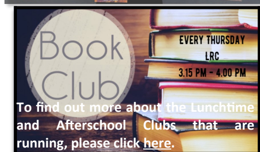
Book Club EVERY THURSDAY LRC 3.15 PM - 4.00 PM To find out more about the Lunchtime and Afterschool Clubs that are running, please click here .