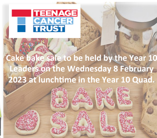
Cake bake sale to be held by the Year 10 Leaders on the Wednesday 8 February 2023 at lunchtime in the Year 10 Quad.

Apprenticeship Evening – Thursday 9 February 2023 6pm to 8pm Calling Parents and Carers Do you want to learn more about apprenticeships and how they work? Come along to the Parents' Evening on Thursday 9 February 2023 and you will have the chance to find out what an apprenticeship is, the different levels of qualifications and the benefits to your young people. There will be a range of interactive and digital information available along with the chance to meet and speak with an apprentice ambassador who can share their own apprenticeship journey.