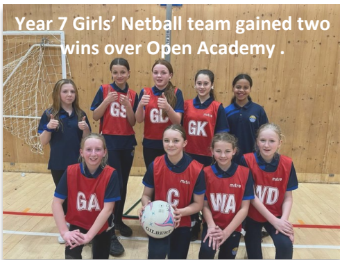
Year 7 Girls' Netball team gained two wins over Open Academy .