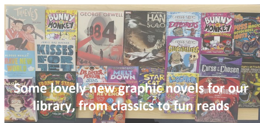
Some lovely new graphic novels for our library, from classics to fun reads