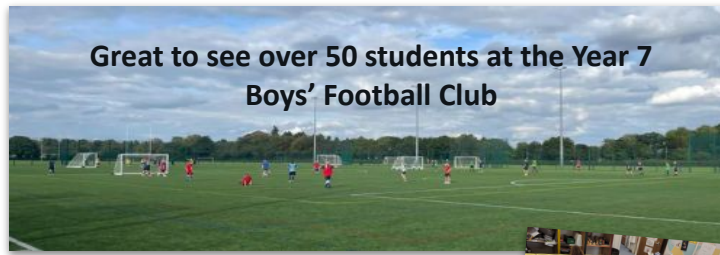
Great to see over 50 students at the Year 7 Boys' Football Club