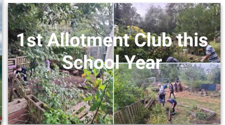
1st Allotment Club this School Year

Diversity Mural Presentation - Towards the end of last year our student community created an incredible mural to celebrate diversity within our school. We are delighted to announce that the presentation of this mural will take place during the Black History Month Community event at 4.00 pm on Wednesday 11 October 2023. We are welcoming all parents and their children to attend the event. If you would like to attend, please complete this form .