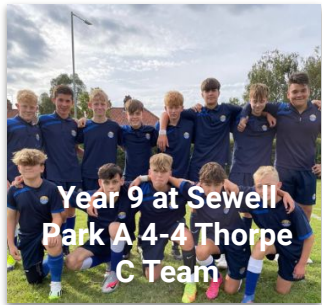
Year 9 at Sewell Park A 4-4 Thorpe C Team