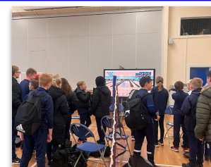
Wii Sports House Event