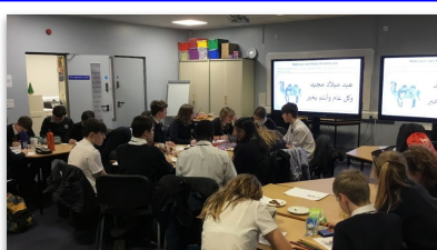
Learning Arabic and Arabic Culture