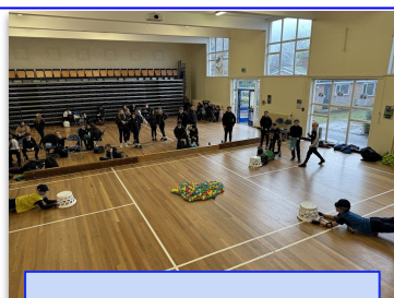
Hungry Hippos House Event

Our local employers tell us that they value soft skills like communication and teamwork and actively recruit employees by looking for these skills. We are aware of this and every minute of our students' time at school plays a part in the development of these key skills. From being on time to lessons, to taking part in the House's Human Hungry Hippos, to being a member of a Year committee, to working in a team in a Drama lesson, we are actively working to develop our students into the workforce of tomorrow. Being in school, on time, and actively engaged in learning develops those key skills our students need to make their way into their chosen career.